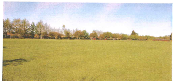
Back fields showing location and proximity of Gymnasium.