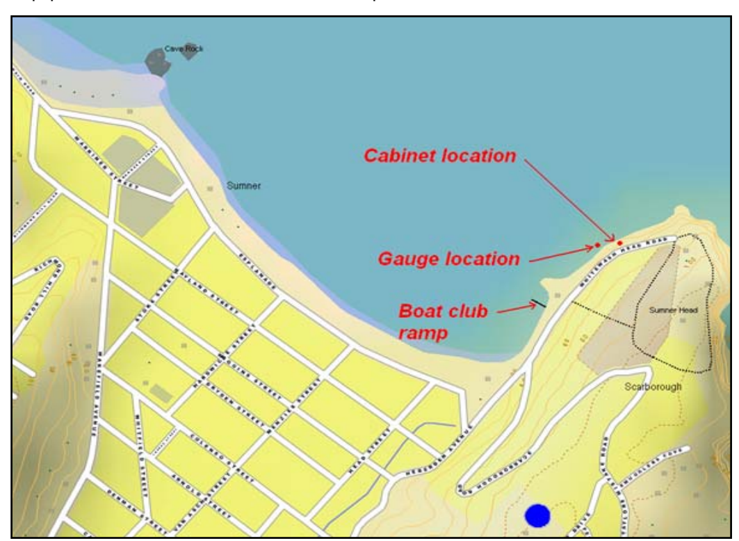
Proposed location of tsunami gauge at Sumner Head

15. The intended location of the gauge is in an area of steep rocky cliffs made up of old basalt lava flows. The sensors will be submerged in the water at the bottom of the cliffs, while the equipment cabinet will be located on the gentler vegetated slopes overlying the cliffs, on the northwest side of Whitewash Head Road. Ducted cable will connect the sensors to the equipment cabinet, which will run off mains power.