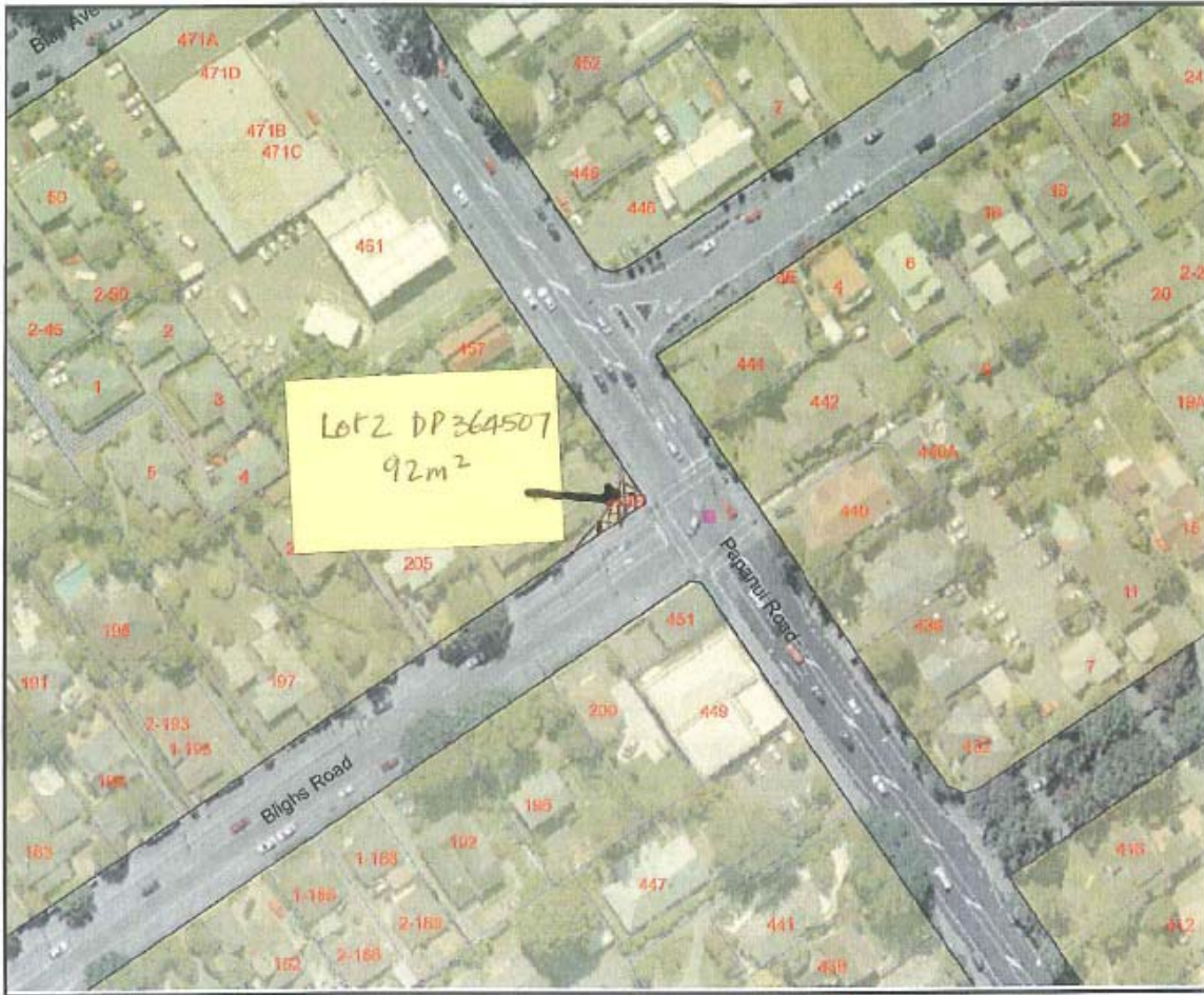
LOCATION OF Lot 2 DP 364507