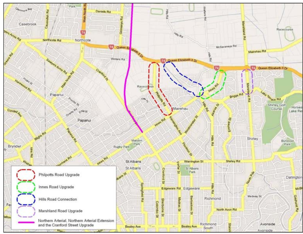
Figure 3.0 Council Northern links project

NZTA have indicated that these links, in particular the Northern Arterial Extension and the Cranford Street Upgrade, are critical for maximising the benefits of the Northern Arterial Motorway. As these projects are the responsibility of the Council, decisions will need to be made with regard to the form, costs and timings of these links as the investigations develop. At this stage it is anticipated that the first round of consultation on these projects will occur from May 2011. NZTA have requested that the consent applications for Northern Arterial and Northern Arterial Extension be lodged concurrently.