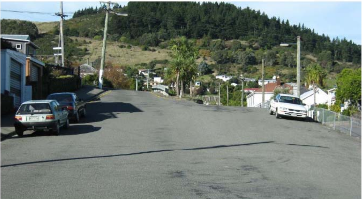
Exeter Street Looking East