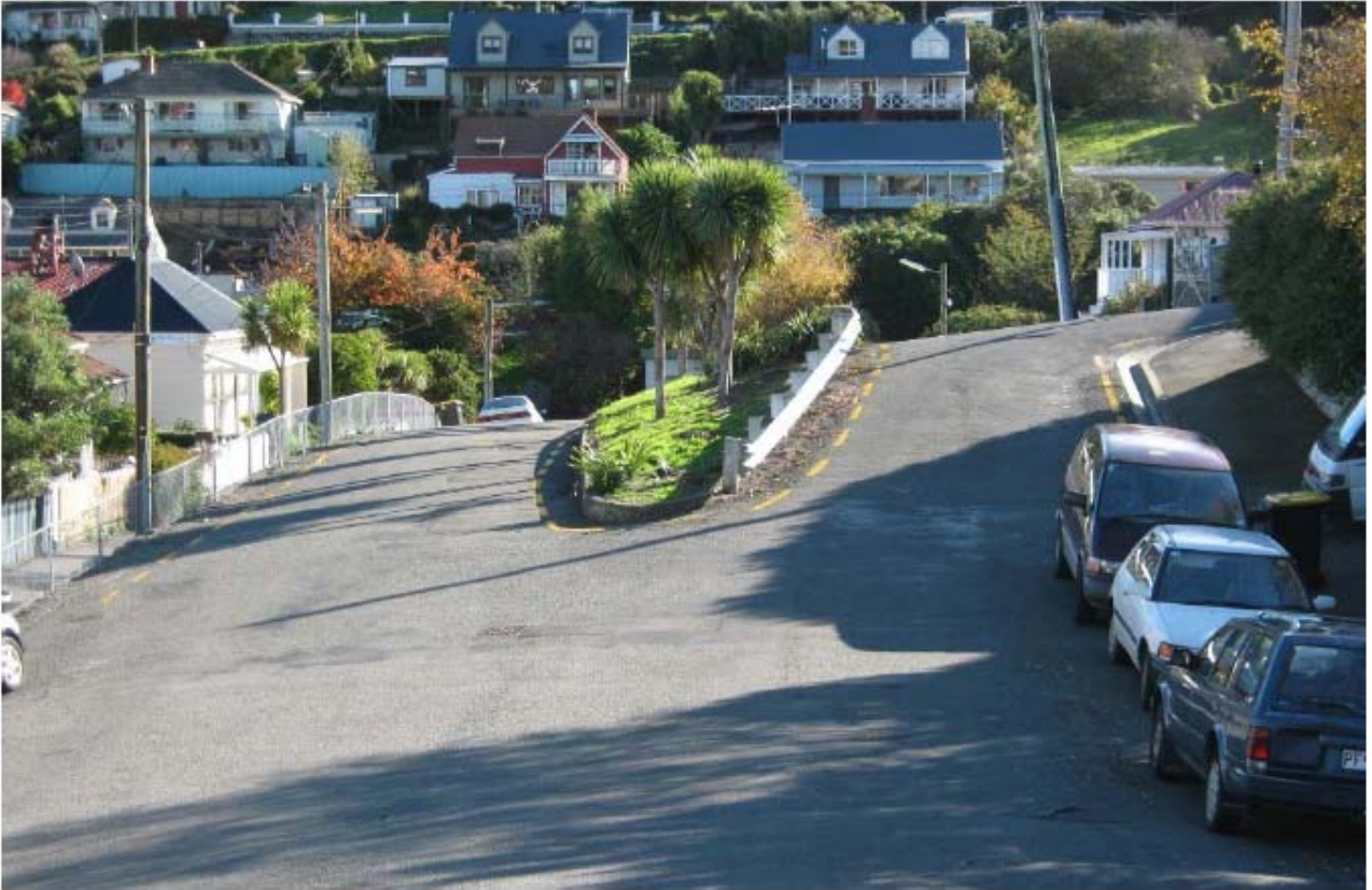
Exeter Street Looking West