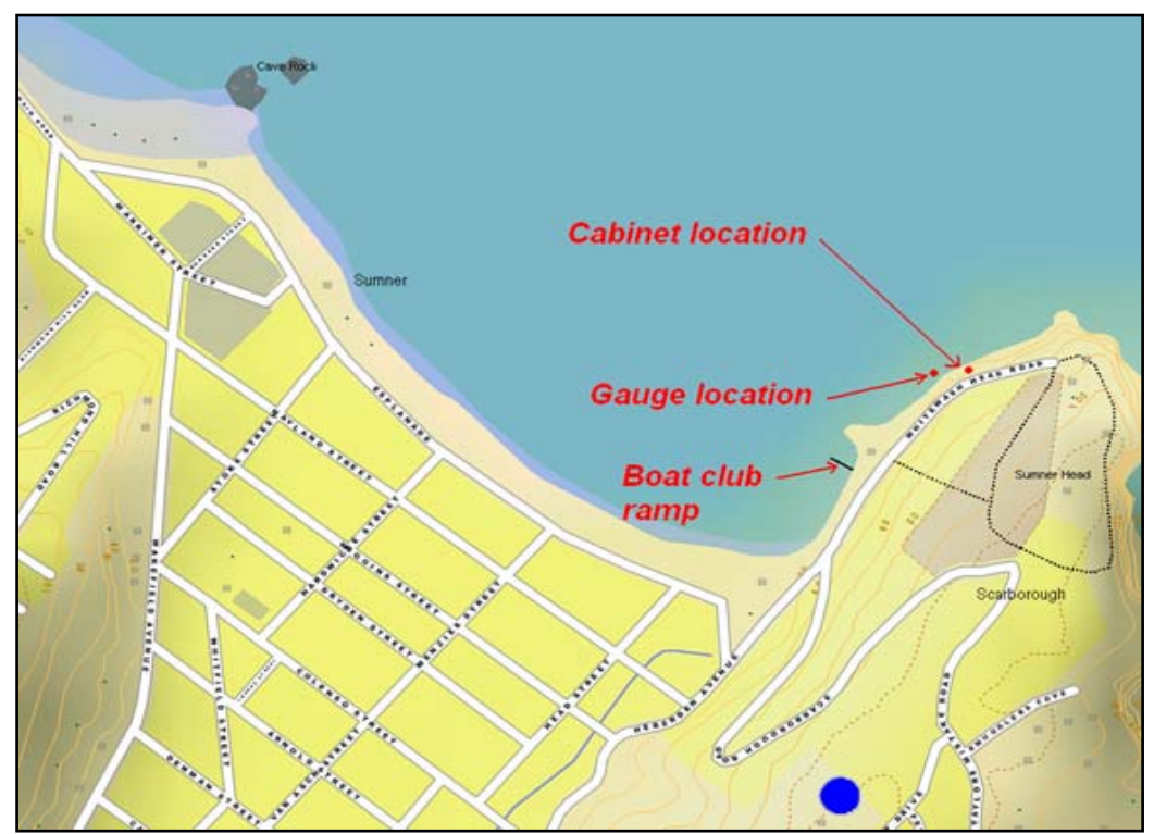
Proposed location of tsunami gauge at Sumner Head

15. The intended location of the gauge is in an area of steep rocky cliffs made up of old basalt lava flows. The sensors will be submerged in the water at the bottom of the cliffs, while the equipment cabinet will be located on the gentler vegetated slopes overlying the cliffs, on the northwest side of Whitewash Head Road. Ducted cable will connect the sensors to the equipment cabinet, which will run off mains power.