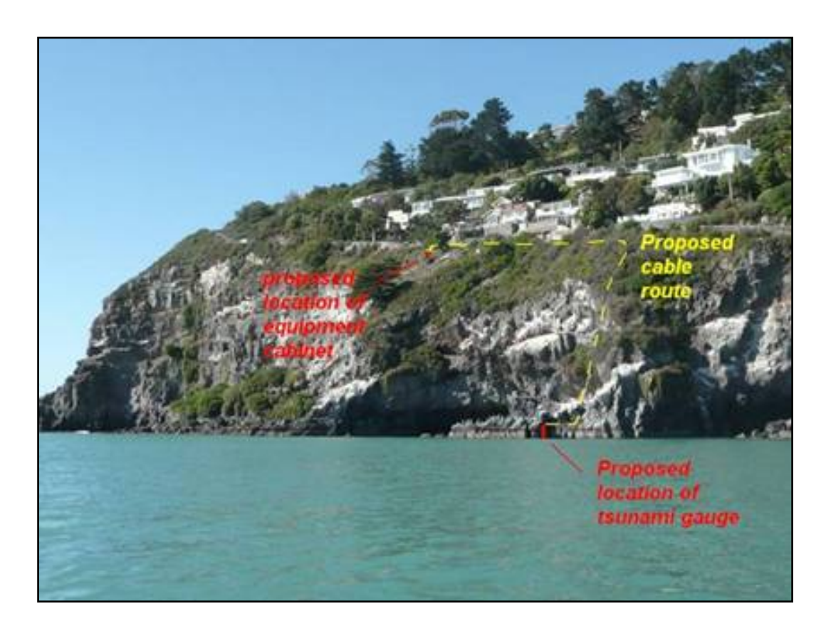
Proposed location of the GNS tsunami monitoring installation

Existing NIWA installation. Cabling runs up the cliff to connect the cabinet to the gauge