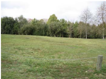
Photo of area to be planted in totara trees.