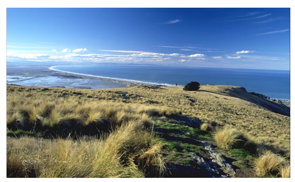
View from Richmond Hill Farm across Pegasus bay

The Richmond Hill property covers an area of approximately 331 ha on the hills above Moncks Bay, Clifton and Sumner. The land is extensively farmed, with part of the lower property formerly managed as a private golf course. A reference to rezone a further 27 ha of land Living Hills on the old golf course area is currently before the Environment Court.