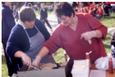
Community events provide an ideal fundraising opportunity for local groups

400 Riccarton/Wigram Ward Garden Gala for Older Adults Globe - Multicultural Festival (see note above under Fendalton/Waimairi Ward)