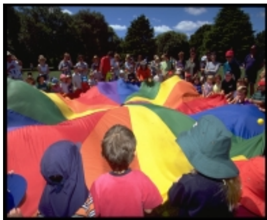
Families enjoy parachute games at Kidsplay - Amazing Games, Jellie Park

250 400 500 Shirley/Papanui Ward Packe Street Art In the Park Brooklands Skate Jam and ramp opening 'Say it Again' Concert