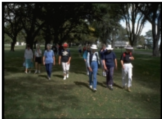
'Active Christchurch' Walkers take a stroll through North Hagley Park

1,290 2,954 450 Citywide Events Kidsplay featuring Amazing Games (1 venue cancelled due to poor weather) Active Christchurch – Summer Walking Programmes Bottle Lake Forest Park Family Orienteering Day