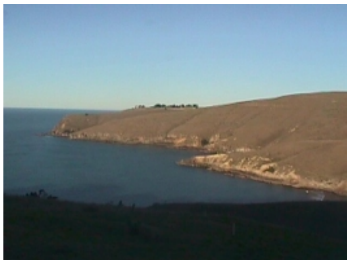
Godley Head Reserve –access only via Taylors Mistake beach

Advice from Legal Services indicates that we would need to prove that this is the only route for emergency access and that no other access can be provided. Although currently the best access is over the existing farm track, other access routes could however be provided in the locality to link with the Summit Rd.