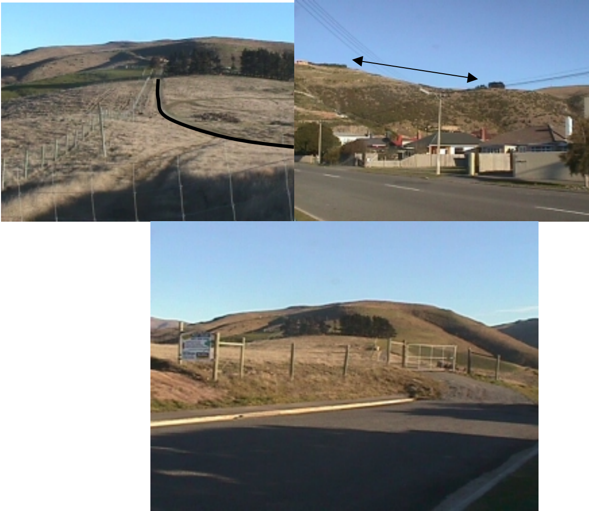
The end of Godley Drive – unfinished and adjacent land for sale