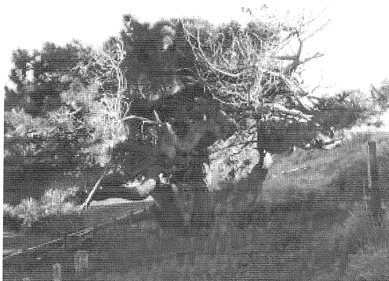
Lovely old pines hacked to make space for walkway.

The hacking of the pines, instead of moving a little sand in a few places, has made the view on the new walkway between Lonsdale St and Rawhiti Ave a rather sorry sight.