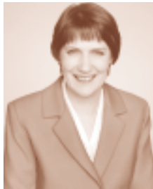
Rt Hon. Helen Clark. Prime Minister of New Zealand

week's events. I also thank the Carter Group and the Community Trust for providing supporting funding. I trust the Heritage Week will reinforce the vital role of heritage in New Zealand.