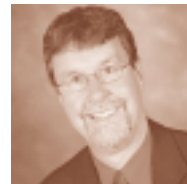
Garry Moore Mayor of Christchurch

I wish you all well for a wonderful week of celebration.