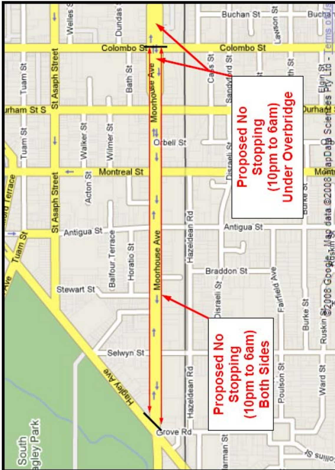
Moorhouse Avenue – Proposed No Stopping (10pm to 6am)