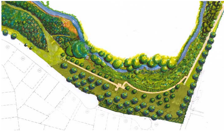
Revised plan for eastern end of reserve.