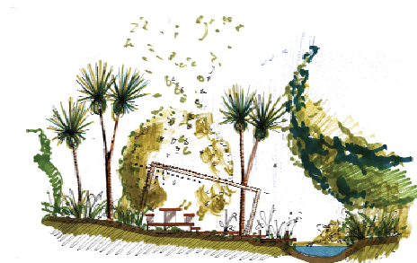
Cross section of jetty access and seating area