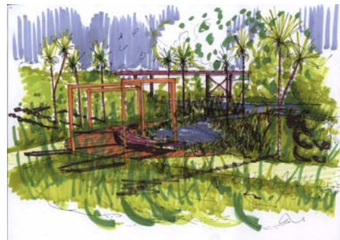
Perspective drawing of the spring feature.