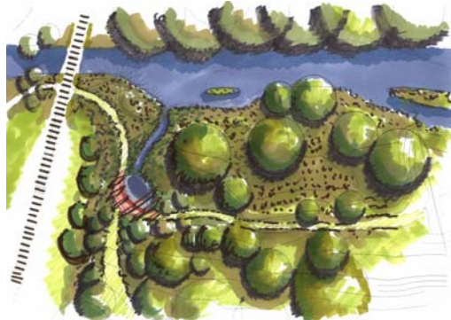
Plan showing the location of the spring in relationship to the Styx River, railway line and existing and proposed walkways.