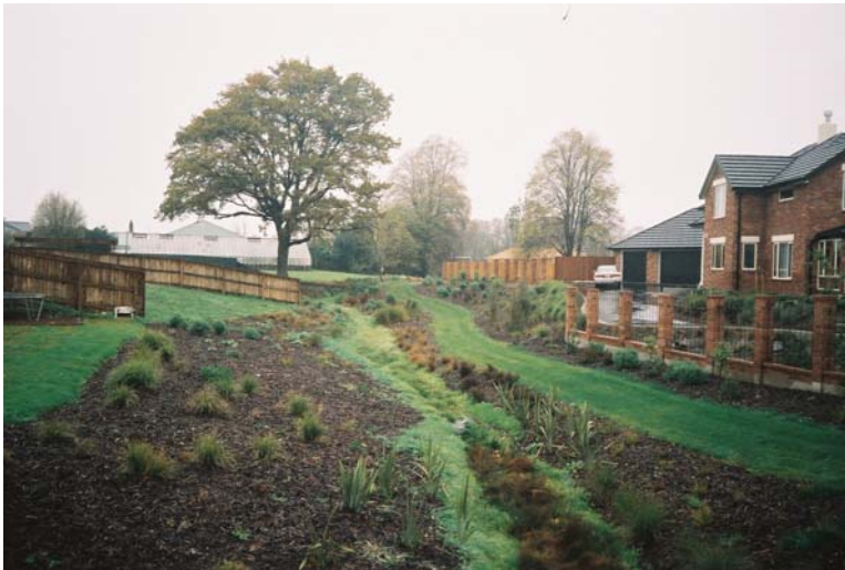
Photo taken downstream of the site. The area of land under consideration can be seen in the distance. A walkway has been developed along the western bank of the Styx River.