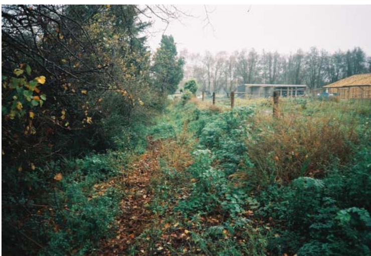
Photo showing the area of land under consideration. The Styx River is located at the base of the trees on the left. Please refer to the next picture. The western boundary of the site is indicated by the post and wire fence. Distance between the Styx River and the fence is approximately 8 metres.