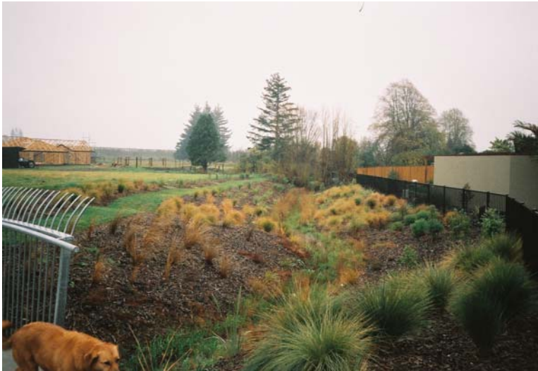
Photo taken upstream of the site. The area of land under consideration can be seen in the distance. A walkway has been developed along the western bank of the Styx River.