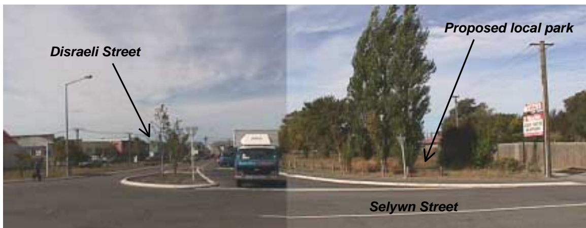
Photo 3 Proposed local park, Disraeli/Selwyn Streets intersection