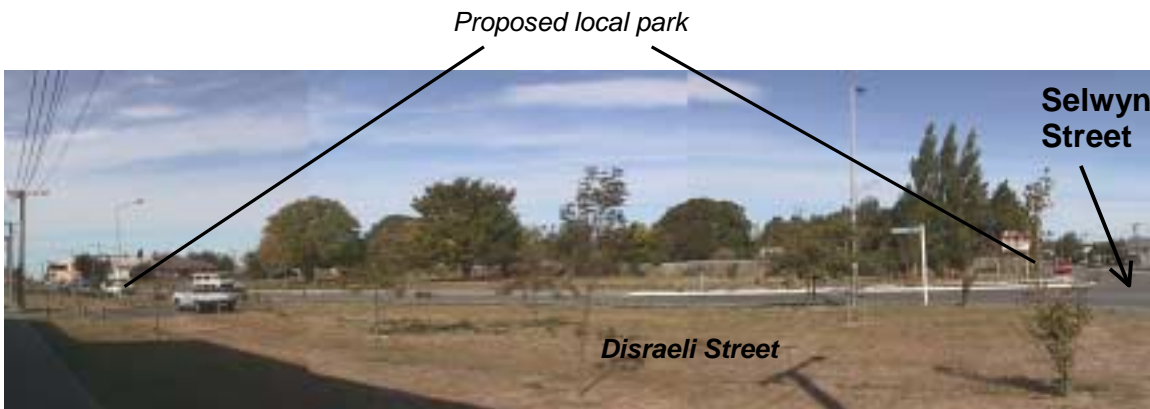
Photo 2 Proposed local park

Addington Cemetery is located approximately 100 metres to the south of the proposed park.