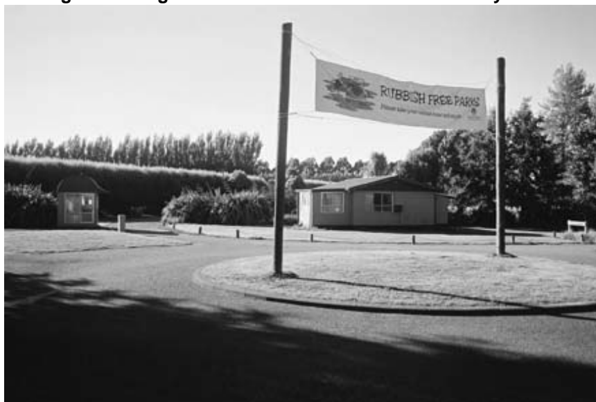
Figure 5: Existing Park Ranger's Office/Visitors Centre at The Groynes Entrance