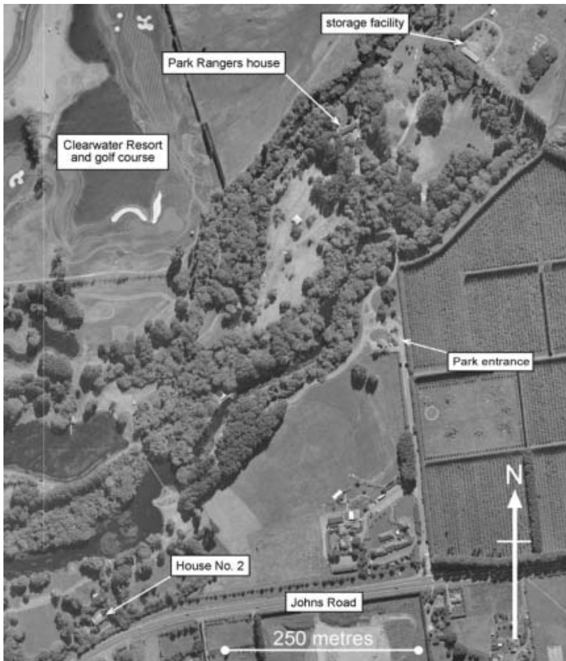
Figure 1: The Groynes Context