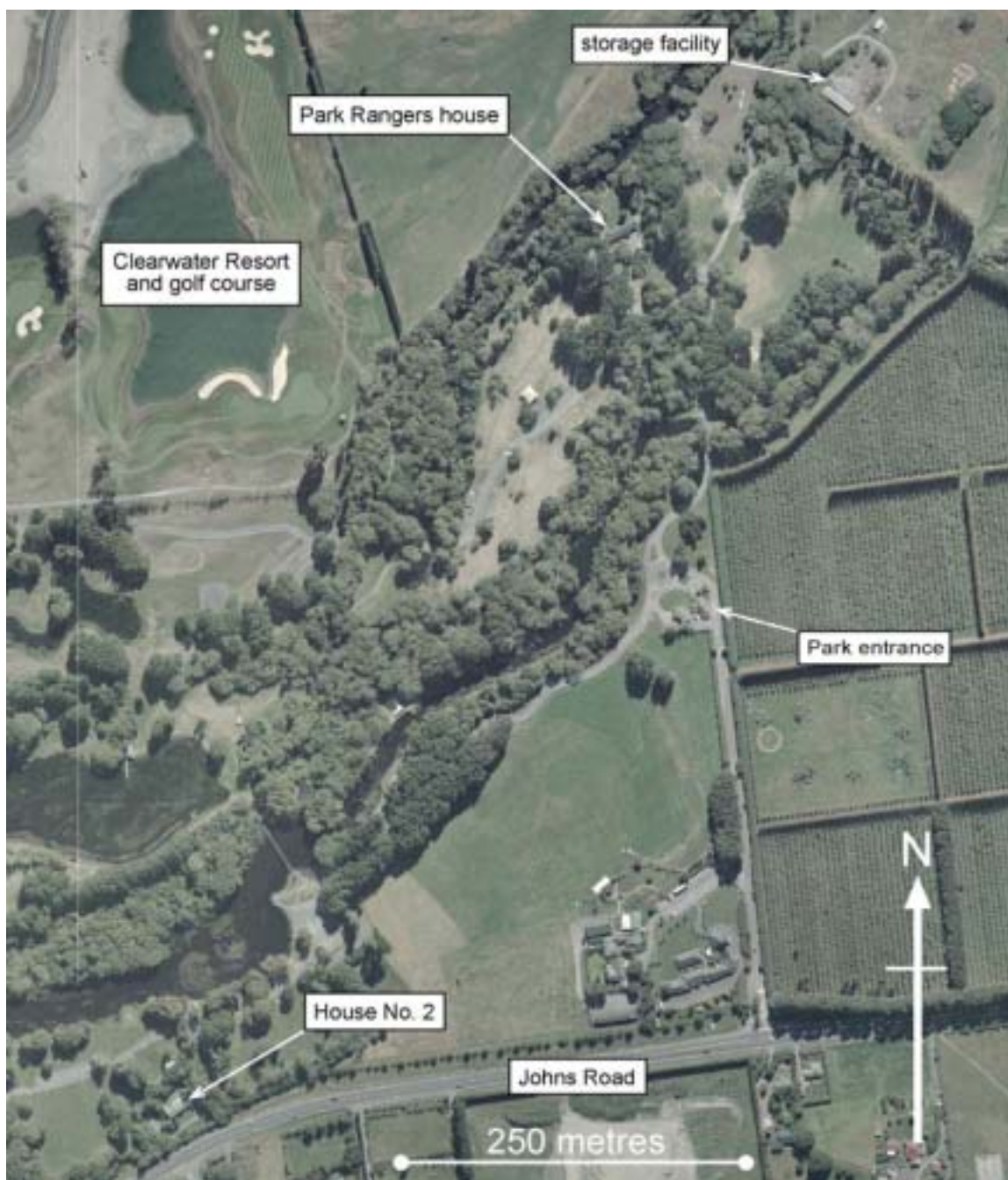
Figure 1: The Groynes context