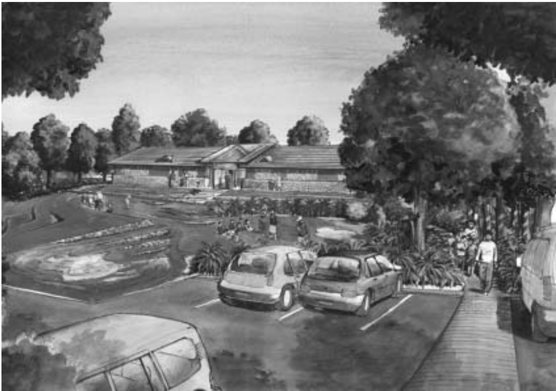
Figure 3: Option 3

The City Council's role in this situation would be to share in partnership with Fish and Game the cost of development, and operation, of the proposed new facilities and enhanced education programmes. A formal contract would be required to formalise the mutual obligations, roles and responsibilities of the two organisations to ensure a successful cohabitation on the site. Management of, and planning for, the park would remain the sole role of the City Council although Fish and Game could be invited to assist in some areas such as waterway monitoring and enhancement.