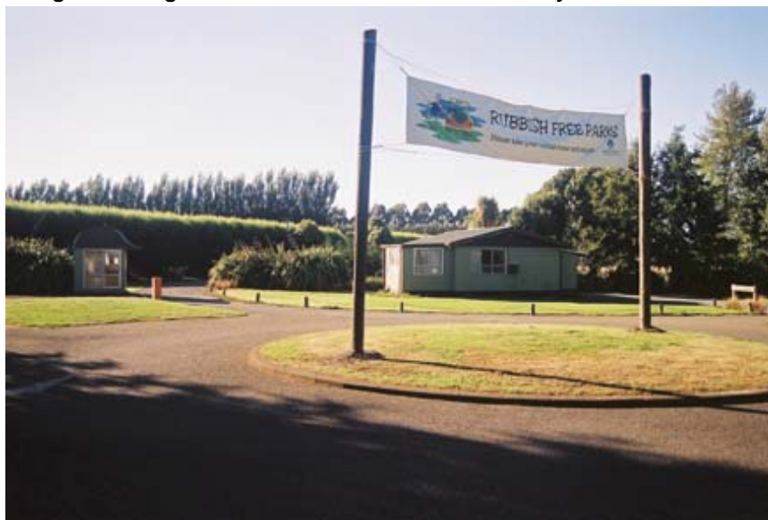
Figure 5 Existing Park Ranger's office / visitors centre at The Groynes entrance