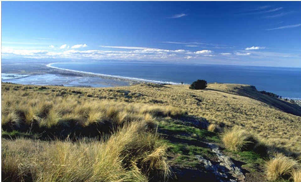
View from Richmond Hill Farm across Pegasus bay

The Richmond Hill property covers an area of approximately 331 ha on the hills above Moncks Bay, Clifton and Sumner. The land is extensively farmed, with part of the lower property formerly managed as a private golf course. A reference to rezone a further 27 ha of land Living Hills on the old golf course area is currently before the Environment Court.