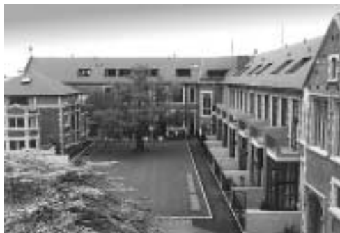
The Peterborough Centre