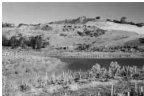
Halswell Quarry Park