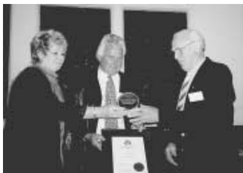
The 2001 Environmental Awards Ceremony