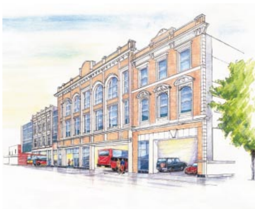
An artist's impression of the Bus Exchange at The Crossing which will become operational in November 2000.