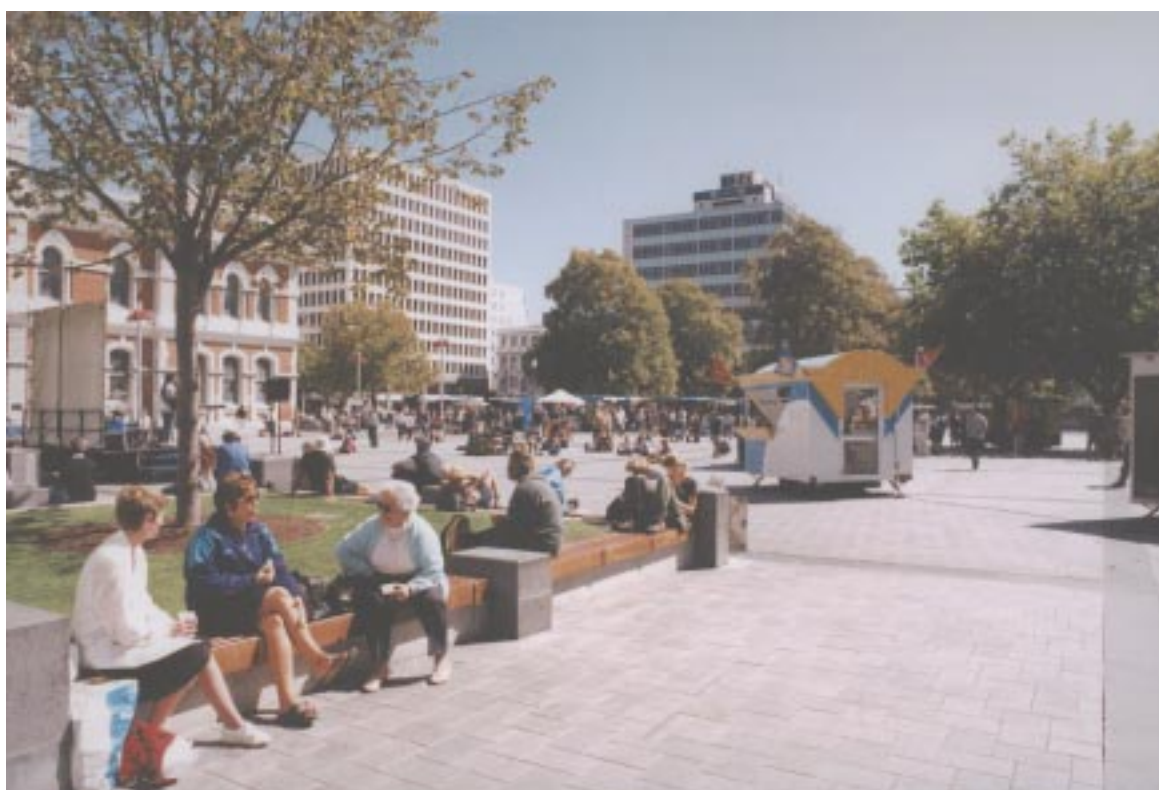
A summer scene in the recently redeveloped Cathedral Square.