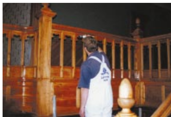
Restoration work which is being completed within the historic Riccarton House.

Note: The Riccarton Bush Trust is a separate legal entity and is not therefore incorporated into the Financial Statements of the Christchurch City Council. The purpose of this page is to show the level of support by the City Council and the scope of the Trust Board activities.