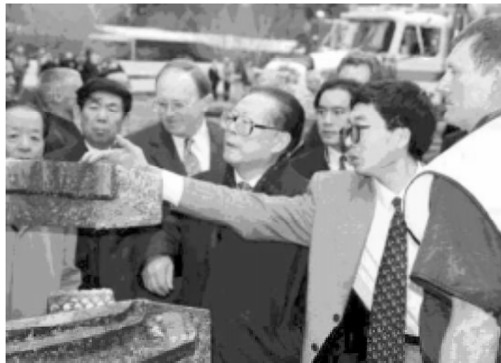
President Jiang Zemin of China inspecting logging machinery at a Selwyn Plantation Board Ltd forest, Darfield - September 1999