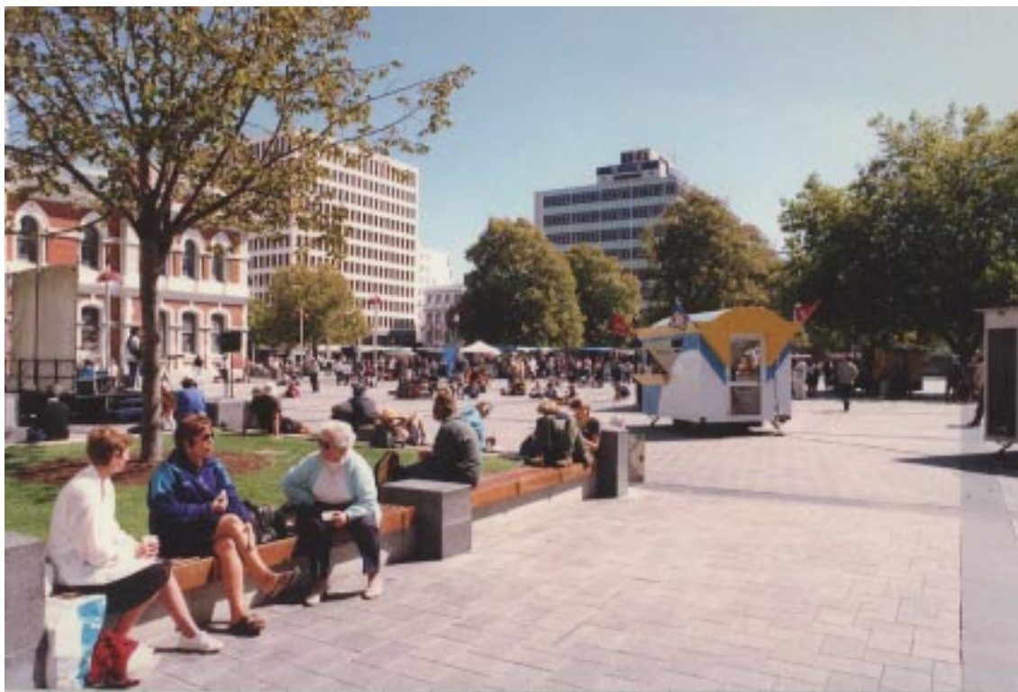
A summer scene in the recently redeveloped Cathedral Square