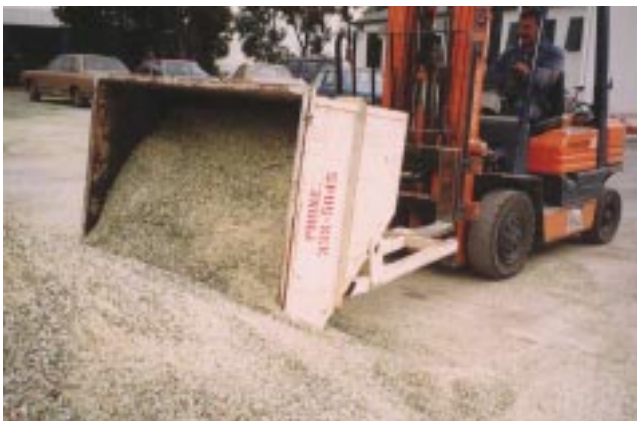
Crushed recycled glass at the Recovered Materials Foundation. This is being used in a variety of products like Blast Glass, Glass Crete, Filter Crystal and Architectural Coatings.