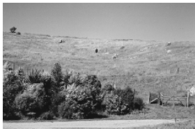
Recent native plantings at the Halswell Quarry Park