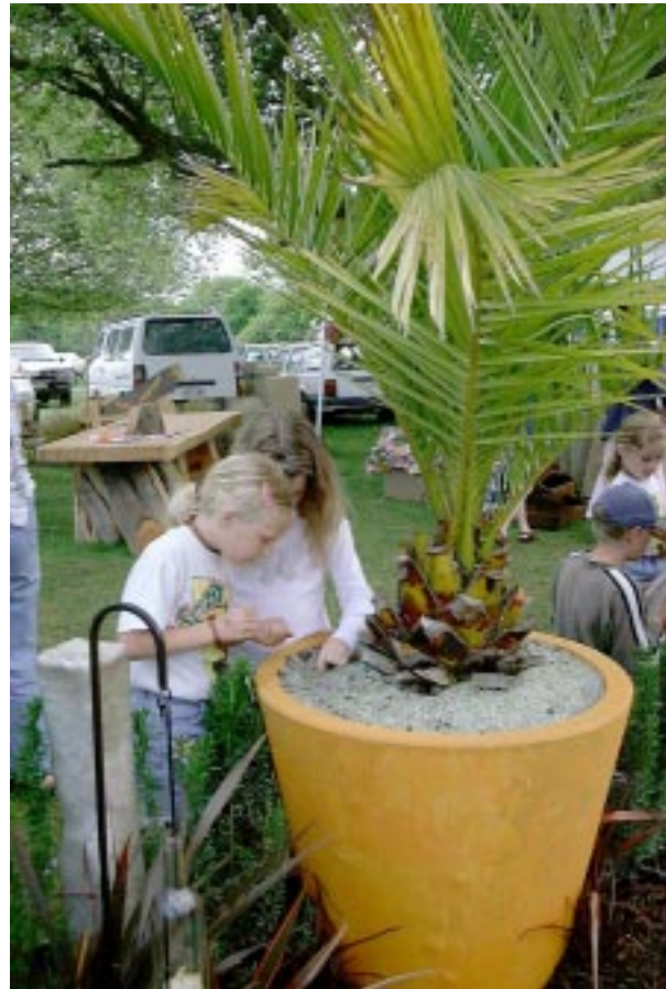
Crushed glass from the Recovered Materials Foundation used as decorative mulch at the 1999 Gardenz Show