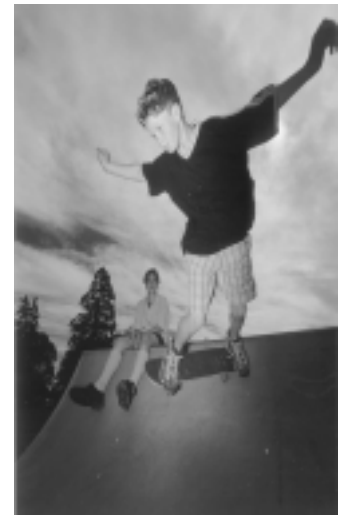
A skater enjoying the new permanent ramp at Sheldon Park.

One of the latest developments is the provision of a permanent skateboard ramp in Sheldon Park, Belfast. The temporary facility proved to be very popular. This project was a joint partnership between the Rotary Club of Belfast and the Shirley/Papanui Community Board.