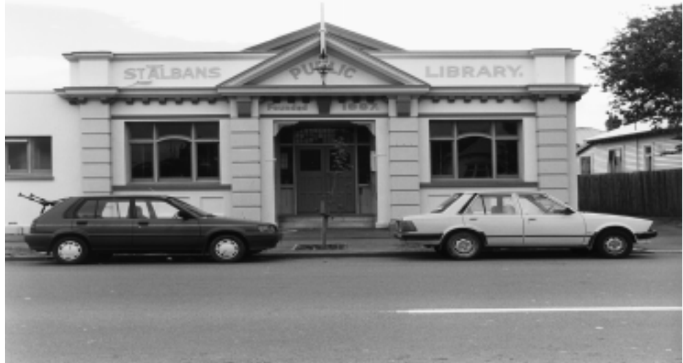
St Albans Community Resource Centre, 1049 Colombo Street.