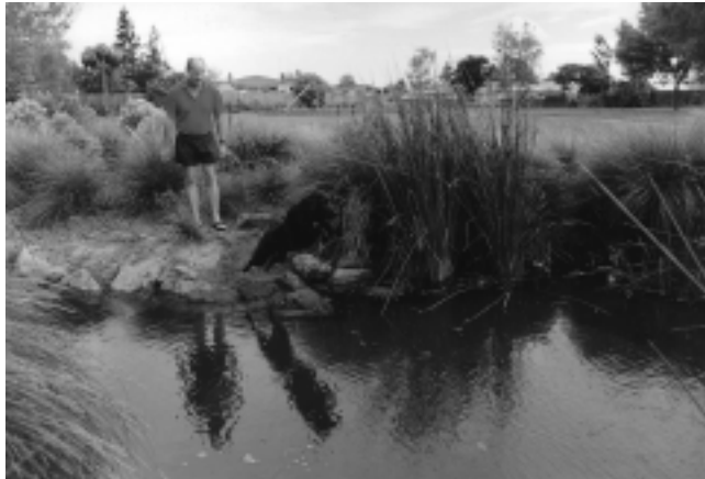
Erica Reserve, an enhanced boxed drain

There are a large number of parks and reserves in the Shirley/Papanui area which are classified as being of metropolitan, major or local significance.