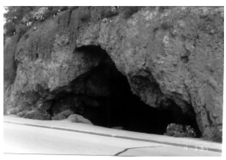
Moa Bone Cave, Redcliffs

Moa Bone Cave, just beyond the eastern end of the Causeway at Redcliffs, opens on to the roadway. This is one of the oldest sites of human habitation in New Zealand, having provided a home and shelter to Moa Hunter Maori, possibly as long as 1,000 years ago. The giant moa, now extinct, and the seashore provided abundant sources of food.