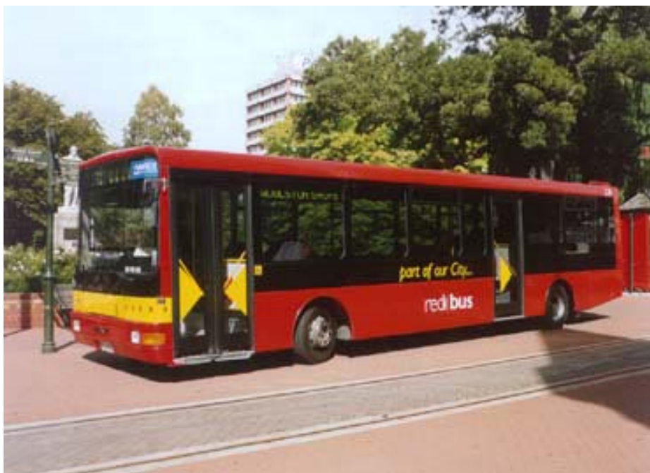
A new look for the Redbus bus fleet.