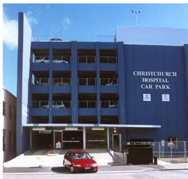
The new joint venture Hospital Car Park which was opened in February 1999.