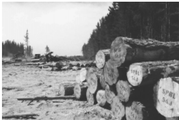
Logging at a Selwyn Plantation Board Ltd Forest.