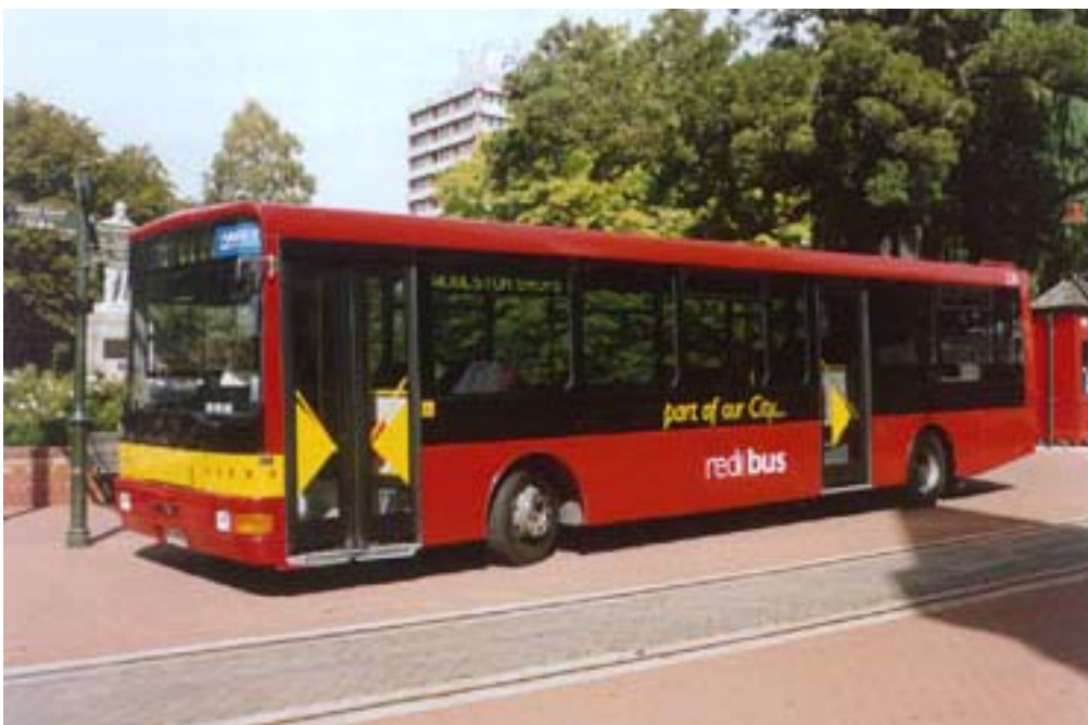
A new look for the Red Bus bus fleet.