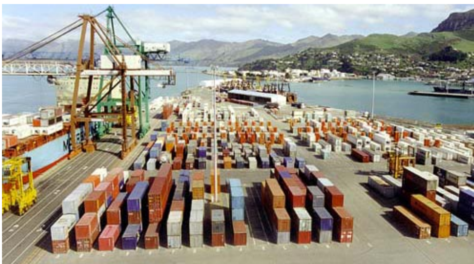
The Container Terminal at the Lyttelton Port Company.