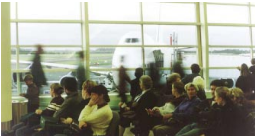
Inside view of the International Terminal, Christchurch International Airport.