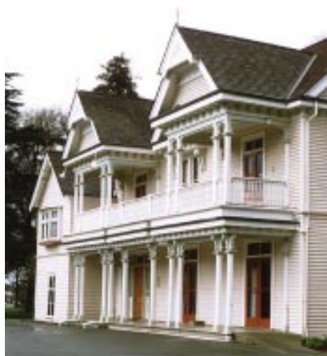
The north facing side of Riccarton House.

Note: The Riccarton Bush Trust is a separate legal entity and is not therefore incorporated into the Financial Statements of the Christchurch City Council. The purpose of this page is to show the level of support by the City Council and the scope of the Trust Board activities.