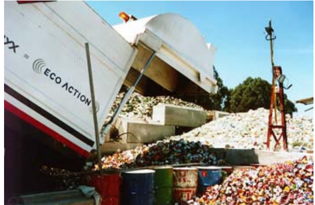
Delivery of sorted recyclable materials to the RMF site in Parkhouse Road.