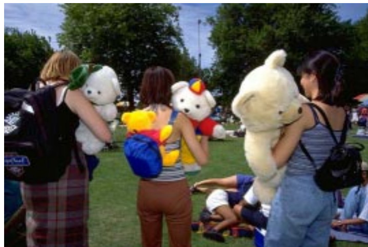
Teddy Bears and friends take part in the SummerTimes Tip Top Teddy Bears Picnic, North Hagley Park, February 1999.