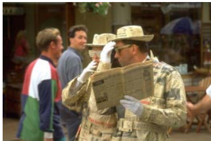
Buskers entertaining during the Buskers Festival in February 1999.

Newspaper People, Aboutface Productions, PO Box 20047, Wellington.