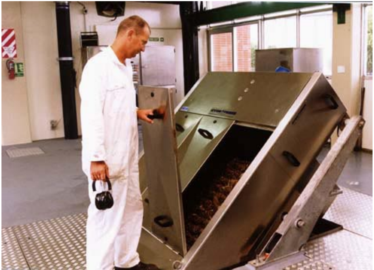
One of a series of new step screens installed at the city's wastewater treatment plant to filter out solid material. These screens are the first part of a $30 million plant expansion which will provide capacity for city growth for another 30 years.