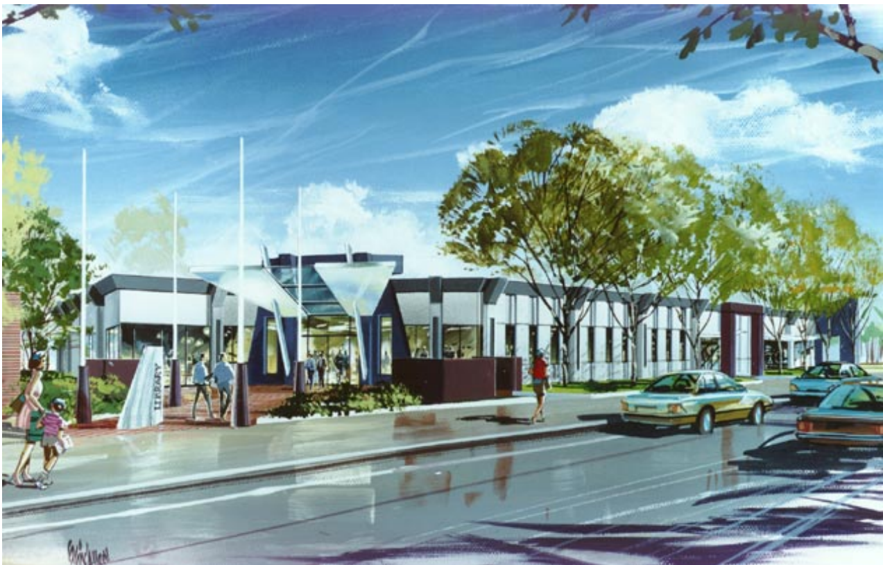
An artist's impression of the new combined Fendalton Service Centre and Library.