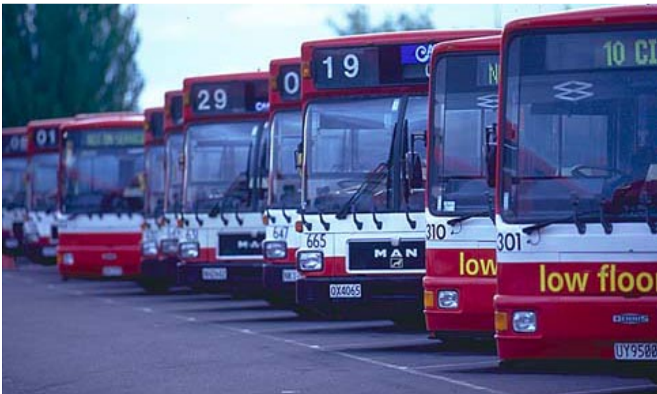
Some of Christchurch Transport Ltd's fleet of buses.