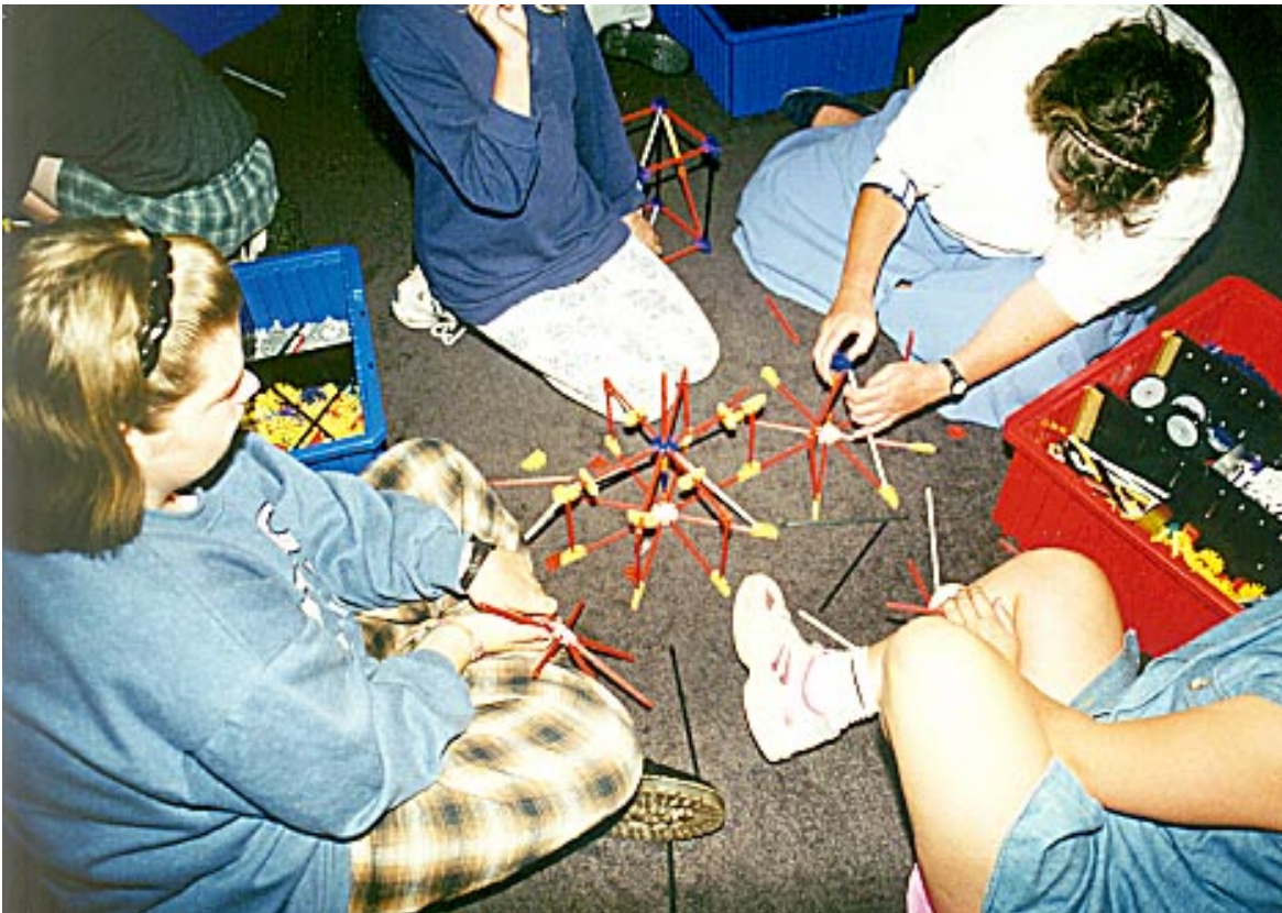
'Science Alive'. A popular destination for both the young and not so young. The Council has agreed to support 'Science Alive' for the next 5 years.