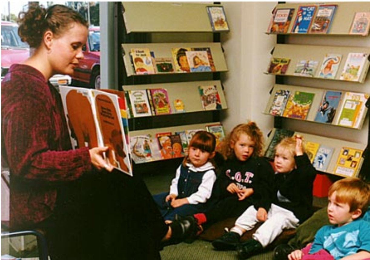
Storytimes for pre-schoolers are provided throughout the Libraries network. This Storytime session was held at Papanui Library.