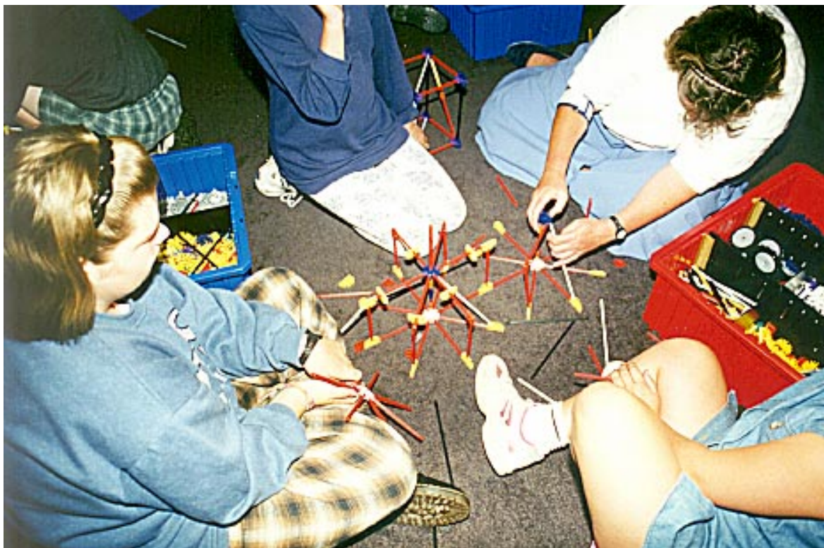
'Science Alive'. A popular destination for both the young and not so young. The Council has agreed to support 'Science Alive' for the next 5 years.