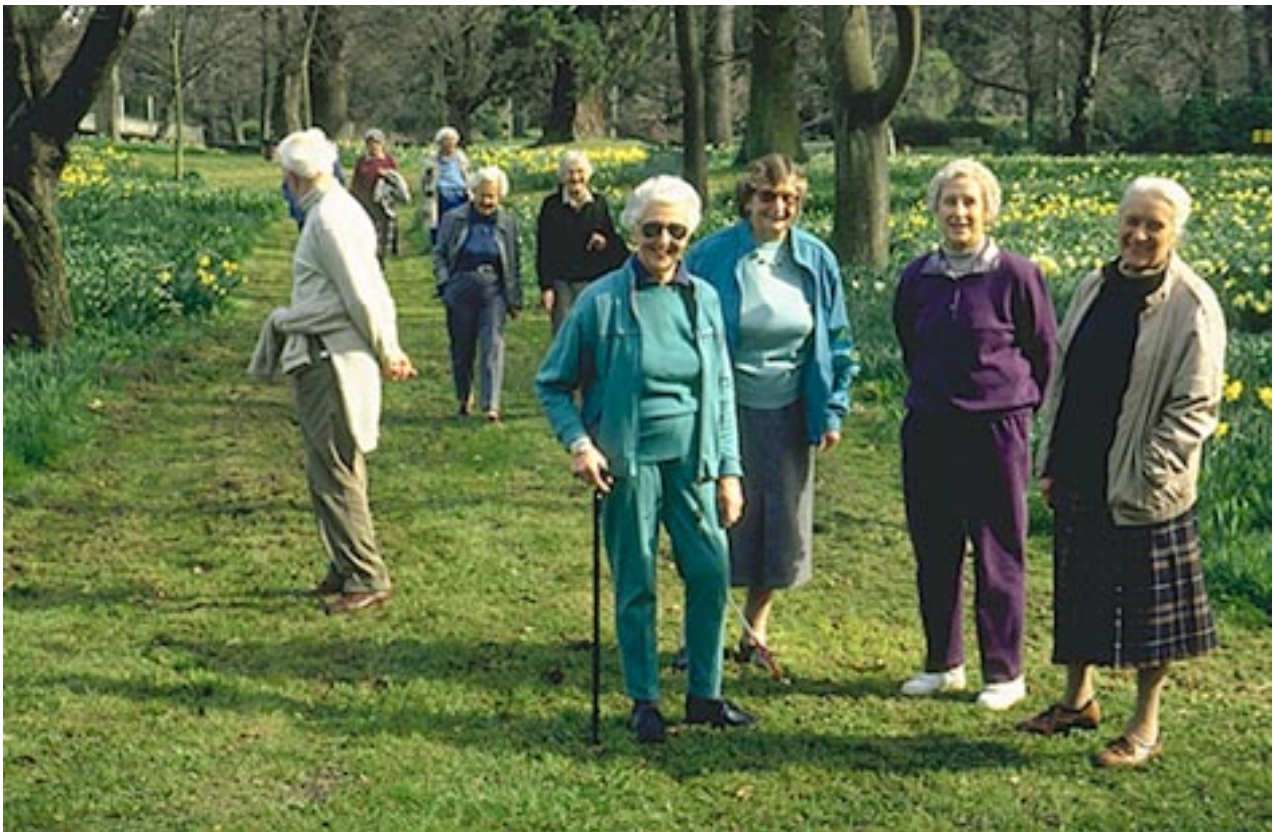
Spring time in Hagley Park enjoyed by some of the many visitors.