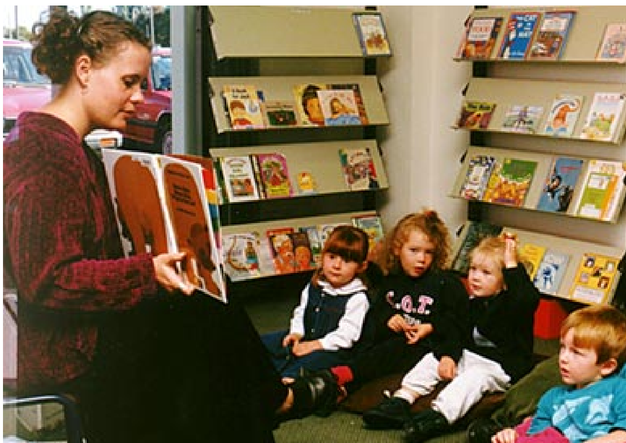
Storytimes for pre-schoolers are provided throughout the Libraries network. This Storytime session was held at Papanui Library.