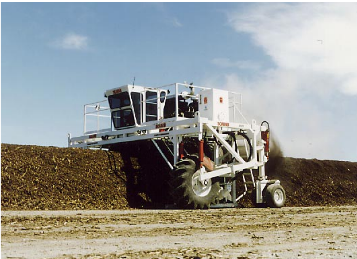
The Scarab Windrow Turner working on a row of shredded green waste at the Composting Facility, Metro Place Transfer Station.