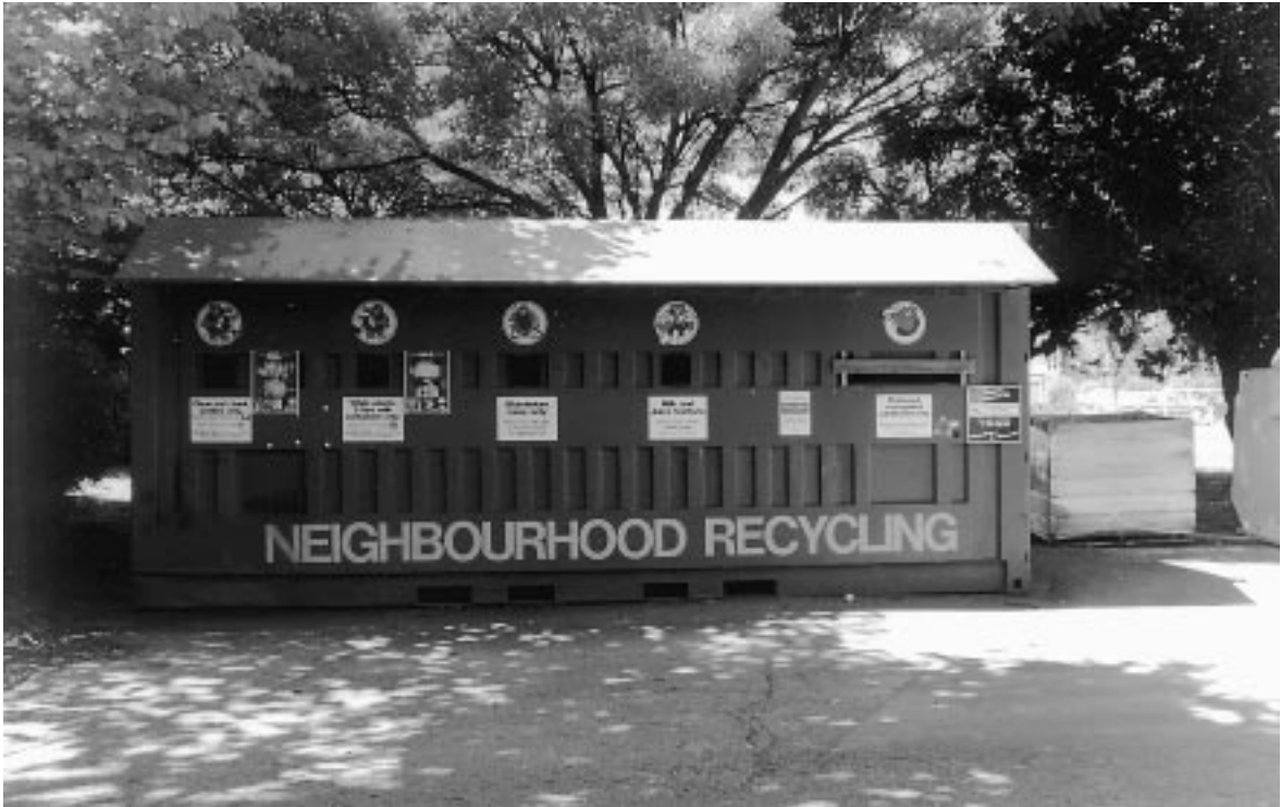
The Beckenham Service Centre recycling point. The Council employs a local group to maintain this facility and all benefits are returned to the Community.