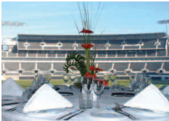
Jade Stadium Limited