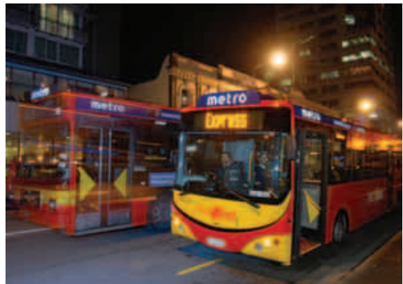
Red Bus Limited