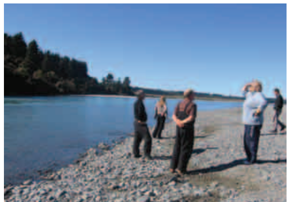
Central Plains Water Trust