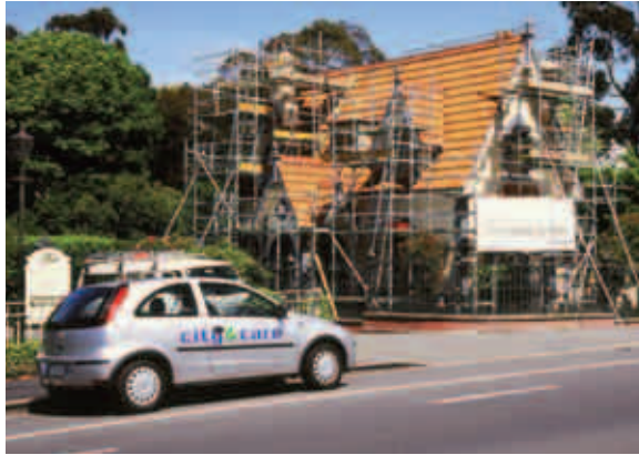
City Care Limited