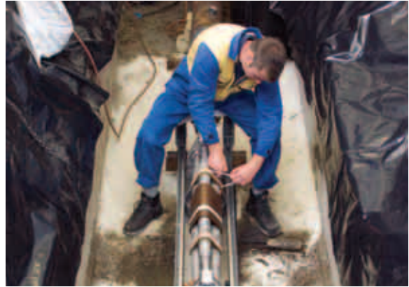
Orion Group Limited