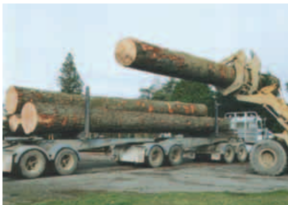
Selwyn Plantation Board Limited