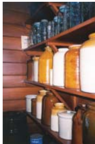
The pantry at Riccarton House.