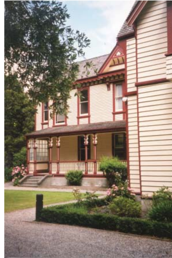
A side view of Riccarton House.