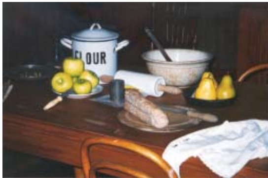
One of the kitchen displays at Riccarton House.