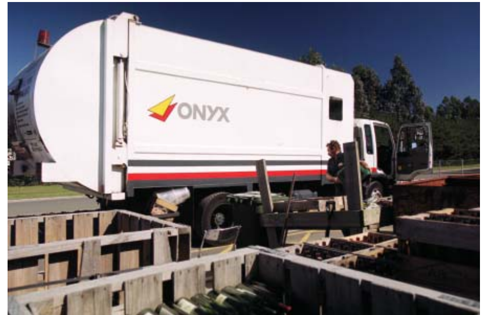
A truck about to unload recyclable material at the Recovered Materials Foundation.