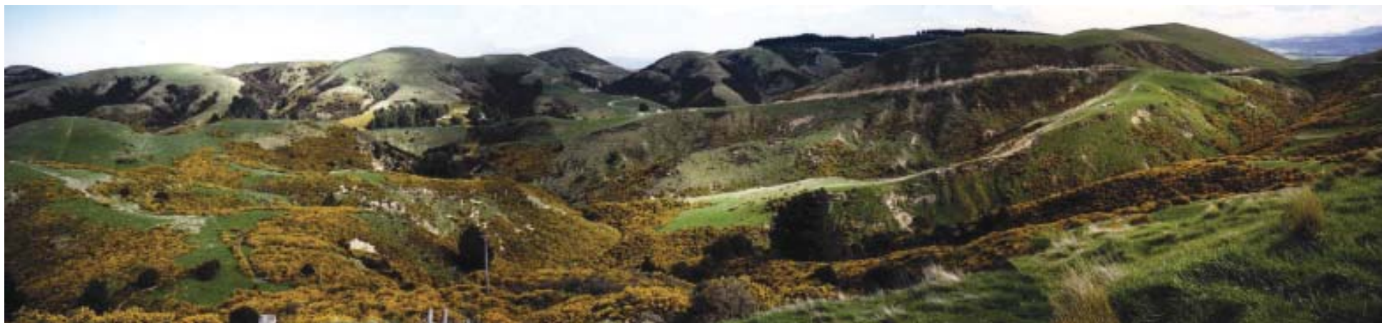
Potential regional landfill site in Upper Kate Valley.